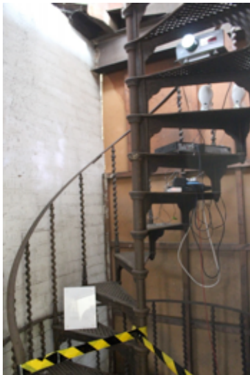
Illustration 1. The stairs used to show the video during the opening of Ort Gallery.

Like no matter what you want to do, you can probably find the place to do that in the building. And the fact that each person can make his or her own space <...> it's nice that we can decorate it and make a little bit, a little bit nicer (T4).