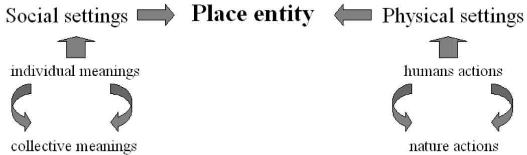
Figure 1. Place entity

Social settings should include individual and collective knowledge and experiences too. Place entity should be viewed as the result of stratified interactions among human beings, a specific physical space and the physical and social settings related to this space. The author agrees with the broad idea that the place is a “space endowed with meanings” (Relph, 1976; Tuan, 1977; Low and Altman, 1992; Cresswell, 2013), although these meanings are not given once for all and are layered along the time. It must be noted that Place entity properties are not static, since they are continuously modified either by Human beings (that is another entity representing an individual, group, community, nation or other people aggregations) or sometime by the nature itself.