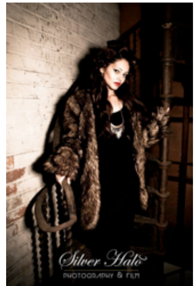
Illustration 2. The same stairs used for the fashion photography.