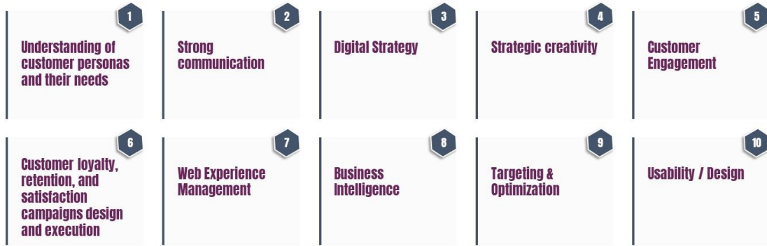
Fig. 1. TOP 10 of competences necessary for digital marketing specialist

The analysis of professional skills (Fig. 2) allows to state that most necessary are skills related with ICT tools directly designed for marketing purposes. The only exception is related with skills of Excel usage.