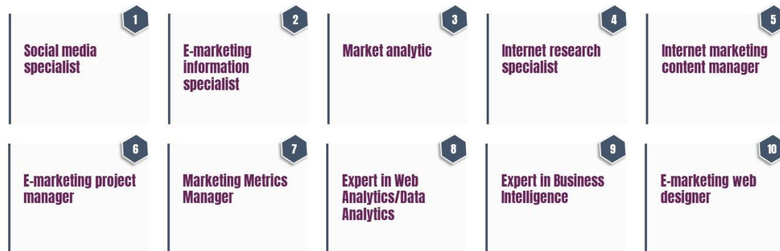
Fig. 3. TOP 10 of positions necessary for digital marketing competences and professional skills

Analysis of professional positions which requires digital marketing competences and professional conditionally possible to divide into three groups regarding types of professional activities: specialists; managers; analytics (Fig. 3).