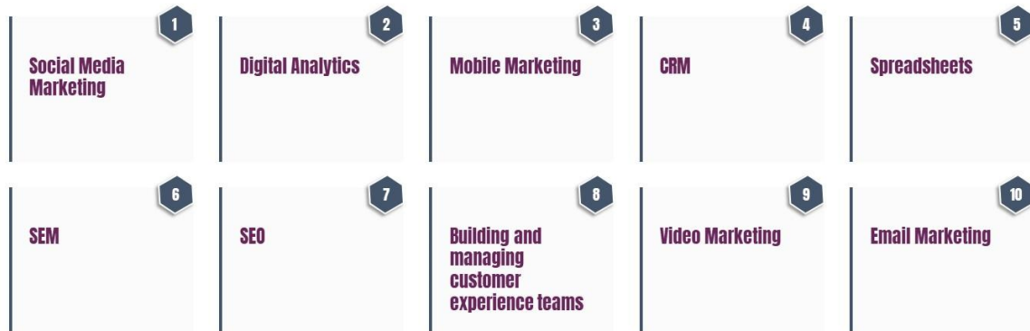
Fig. 2. TOP10 of professional skills necessary for digital marketing specialist

The analysis of professional skills (Fig. 2) allows to state that most necessary are skills related with ICT tools directly designed for marketing purposes. The only exception is related with skills of Excel usage.