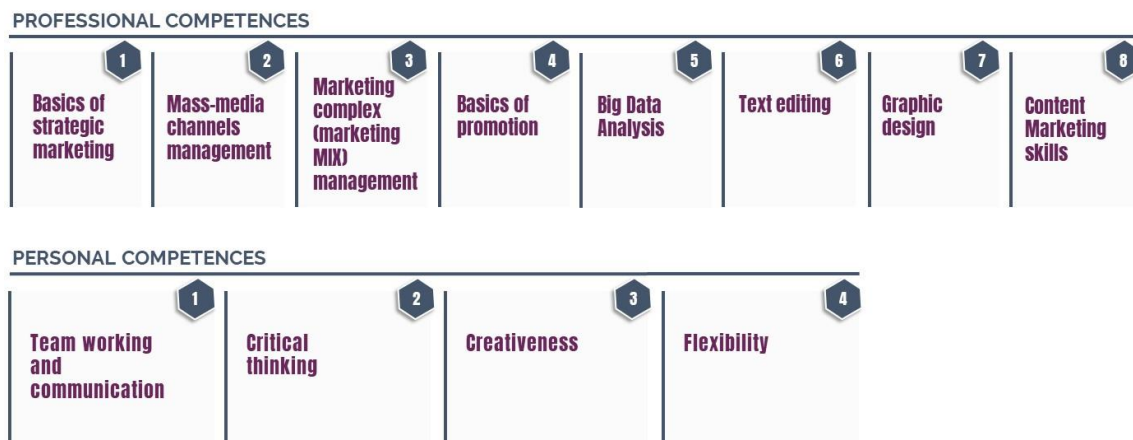
Fig. 5. Additional competences necessary for digital marketing specialist

Feedback regarding competencies necessary for digital marketing specialist it is possible to divide into two areas related with nature of competences: personal competencies and professional competences (Fig. 5).